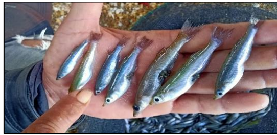
Figure 2. Adrianichthys oophorus caught by fisherman for consumption.