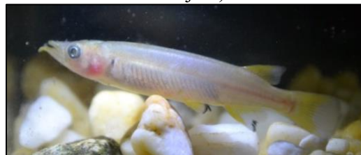
Figure 4. Female Nomorhamphus celebensis 5.3 cm TL.

Most introduced fish species from the Cichlidae in Lake Poso (three species). These fish were Cichlasoma sp. or flowerhorn, O. niloticus , and M. auratus (Figure 5). Other introduced fish species found were from the Anabantidae, Aplocheilidae, and Chanidae families, each consisting of only one species. The introduced species used as consumption fish and the main catch of fishermen is tilapia. Channa striata and A. testudineus are also consumed by the public but are less popular.