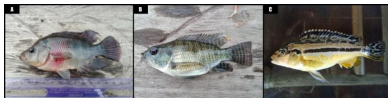
Figure 5. Cichlids species in Lake Poso, A. flowerhorn 13.5 cm TL, B. Oreochromis niloticus 7.1 cm TL, and C. Melanochromis auratus 6.3 cm TL (Photograph A & B by ©K P Bandjolu, and C by ©E Madiyono).

Most introduced fish species from the Cichlidae in Lake Poso (three species). These fish were Cichlasoma sp. or flowerhorn, O. niloticus , and M. auratus (Figure 5). Other introduced fish species found were from the Anabantidae, Aplocheilidae, and Chanidae families, each consisting of only one species. The introduced species used as consumption fish and the main catch of fishermen is tilapia. Channa striata and A. testudineus are also consumed by the public but are less popular.