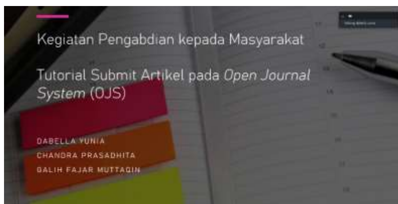
Figure 2. Submission of Material