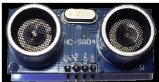
Figure 2. Ultrasonic Sensor.

In this study designed an automatic door handle control system that can open the door automatically if in front of the door there is a hand wave. In this research, two ultrasonic sensors are placed in front and on the back so that it can detect hand waving properly. The automatic door control system process utilizes Arduino Uno R3 as a microcontroller which is connected to two ultrasonic sensors, a DC motor as a driver for the door handle, each component is connected to the LM2596 step down which is used to lower the voltage so that all components are safe and acceptable to the microcontroller.