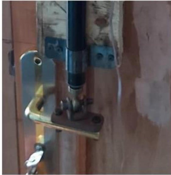
Figure 4. Actuator.

results of the test of automatic door handle opener without touch the following are the results of testing the automatic door opener without touch as follows: