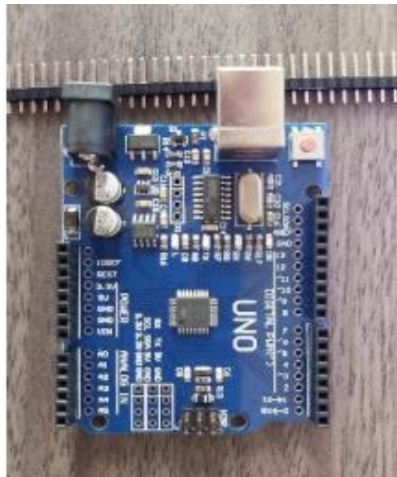
Figure 1. Arduino board circuit.

The Arduino system uses an automatic sensor system. Arduino is an open source electronic kit that contains a microcontroller with the AVR type. The microcontroller can be programmed using a computer. In embedding the program, it can read input, process input, and produce output as desired