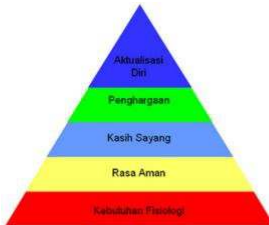
Figure 1. Maslow's Theory of Needs

Maslow's theory of needs is one of the psychological theories introduced in the Psychological Review in 1943 by Abrahama "A Theory of Human Motivation". This assumes that lower-level needs must be met or at least sufficiently met before the higher-level needs.