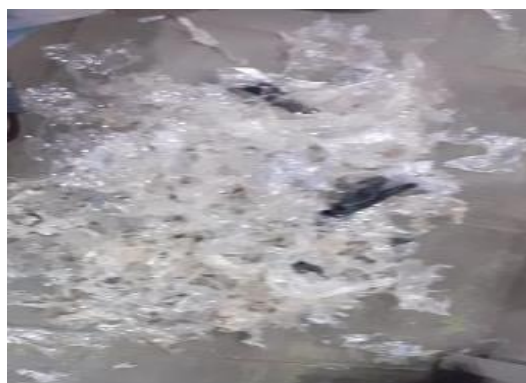
Figure 2. PE