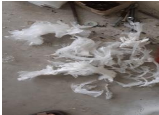
Figure 1. HDPE

The results above are the results of testing each chopping. Here are the chopped results for each type of plastic with different variations, as shown in Figure 1-3.