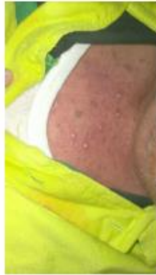
Figure D Red nodules with pus accompanied by red rashes all over the patient's body