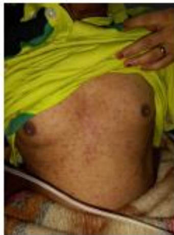
Figure A Patient's skin blisters