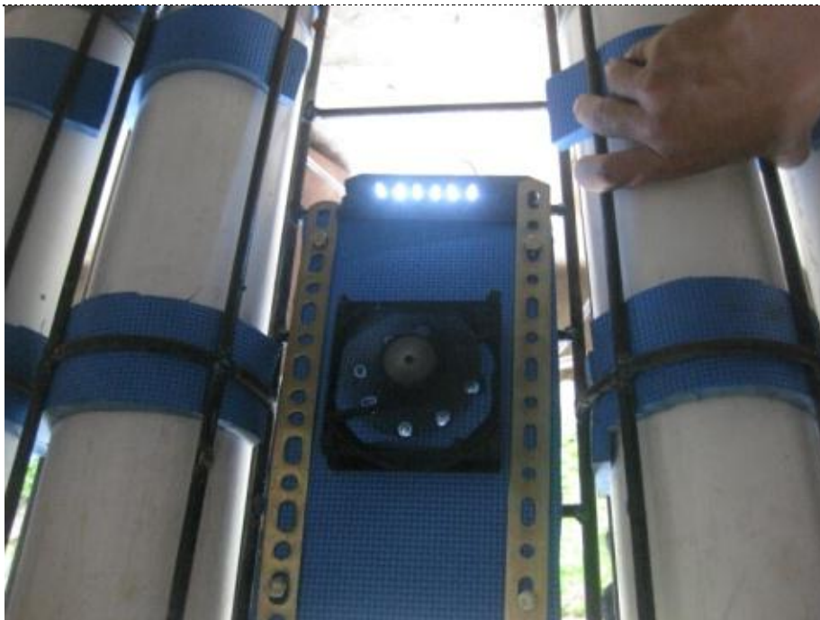
Figure 3. Testing with Light LED