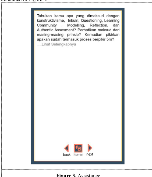
Figure 3. Assistance

Students if wrong in answering, will be guided with help or scaffolding in the form of direction questions to answer or remember previous knowledge in order to answer and understand the material submitted. Questions raised in this teaching material help students indirectly to understand the material. The assistance contained in Figure 3: