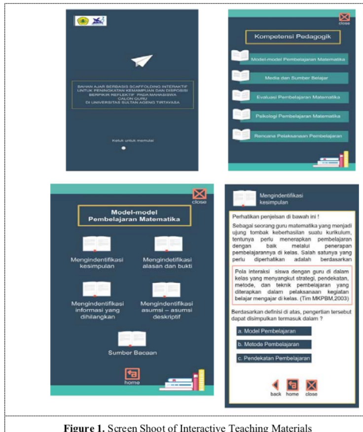
Figure 1. Screen Shoot of Interactive Teaching Materials

Learning Resources; Evaluation of Mathematics Learning; Learning Implementation Plan; Psychology of Mathematics Learning; and Screenshot of teaching material presented in Figure 1.