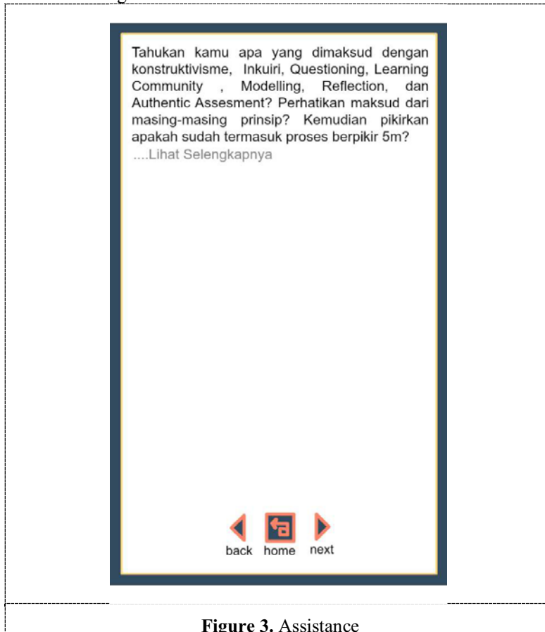
Figure 3. Assistance

Students if wrong in answering, will be guided with help or scaffolding in the form of direction questions to answer or remember previous knowledge in order to answer and understand the material submitted. Questions raised in this teaching material help students indirectly to understand the material. The assistance contained in Figure 3: