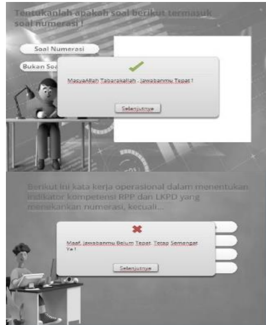
Figure 4. Evaluation of Understanding Interactive E-Module