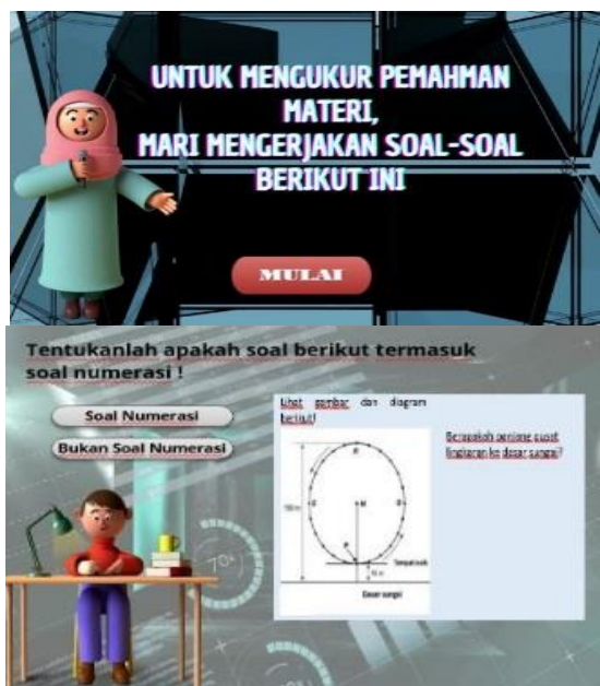
Figure 4 (See Figure 4) evaluates the understanding of MCA numeracy in the Interactive E-Module. Its application is through the submission of questions based on the indicator. Application of interactive evaluation activities so that respondents can determine whether the answer choice is correct or wrong.