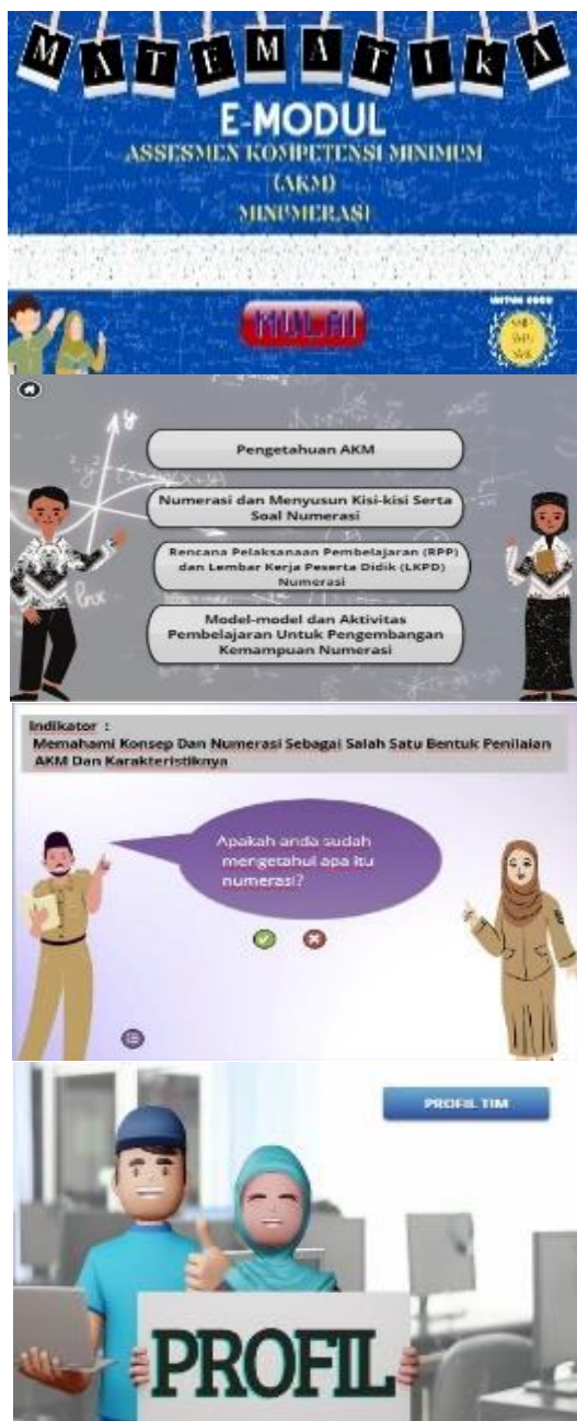
Figure 2. Electronic Interactive Module

Based on experts' assessment and declared feasible, feasible, and attractive, the E-module product proceeded to the trial stage for the teacher subjects. Here is an overview of the module's electronic products that have been declared valid in the assessment of experts: