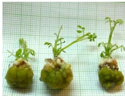
Figure 3. Diameter of callus on B3K0 media

Observation of callus diameter was carried out at the end of the observation at 8 weeks after planting (Figure 3). The measurement of callus diameter was done by placing a soft explant on sterile millimeter block paper. Then the callus formed was photographed with a camera to measure its diameter using Image J, which was Image Analysis software. All callus formed were at the base of the stem, the part of the scar that was in direct contact with the media. This was because callus was formed because of injury to the tissue and response to plant growth regulators. The appearance of callus on the injured part was thought to be due to tissue stimulation on the explants to cover the wound. According to [14], callus consists of an abnormal mass of thin-walled parenchyma cells that are loosely arranged and arise from proliferating stem tissue cells as a result of injury, callus forms at the ends of the cut stems or roots. Based on the data, the adding of BAP or Kinetin on media did not have a significant effect on the Indigofera callus diameter and no interaction between BAP and Kinetin for callus diameter. The callus that was formed had an average diameter of \pm 1.34 cm.