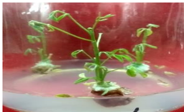
Figure 1. The shoots length of Indigofera in vitro

The adding of BAP or Kinetin did not have a significant effect on the time parameters of Indigofera shoots appearing (Table 1). The result showed that no interaction between BAP and Kinetin added. The mean shoot appears time in all treatments was 1.45 weeks after planting. The shoot appear time were varied from 1.31 week after planting in B1K0 treatment (BAP 1 mg/L) to 1.60 in B2K0 treatment (BAP 1.5 mg/L). However, when the sprouts appeared, they did not have a real effect.