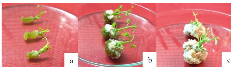
Figure 4. Callus Texture (a) Compact in B0K0 media, (b) Intermediate in B2K3 media and (c) Crumbs in B1K2 media

Note: the numbers followed by the same letter in the same row and column showed no difference according to the 5% level of the DMRT test.