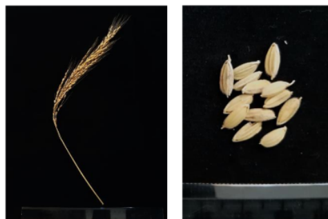
Figure 2. Characters of Kewal Bulu Putih

Local varieties of rice are relatively rare to be cultivated by farmers. We found Kewal Bulu Putih at Kecamatan Siring, Anyar, Banten (Figure 1.). One of the local varieties which have relatively long-life cycle (long harvest time) of six months.