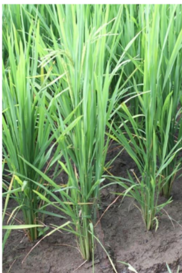
Figure 1. Soil rhizosphere of paddy rice plants.

Fungal isolation was done using serial dilution culture methods following the protocol of Crous (2006) and Prambudi with modification [6] [7]. 10 grams of soil was diluted with 90 ml of physiological NaCl solution. Serial dilution was performed and 1 mL of final concentration 10^{-6} was plate on PDA media with antibiotics and incubated at 25°C for 18 hours. Fungal colonies grown on PDA were transferred to new PDA plates. Fungal identification was performed based on their morphology and microscopic characters following Barnet & Hunter (1972) and Samson et al. (2016) [8].