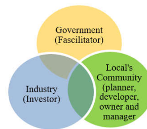
Fig. 1. Stakeholders in community-based tourism

Sometimes, despite having a cooperative, CBT programs can still break up before or after they reach the growth stage due to various reasons, including the changing economic landscape of its community. After all, CBT operates on a voluntary basis and local people can decide on how and when they want to participate. Imminently, this scenario can jeopardize CBT operations. In some places however, when the villagers grow older and have stopped farming activities, they would stay home in their empty nests. At this point, some would return to and rekindle their passion for CBT for reasons such as loneliness, additional income or socio-cultural pursuits. However, such motivations to re-enter CBT may not be strong enough to sustain a cooperative. Economic and other tangible pursuits triggered by “internal awakening” have been found to be a strong push factor of profit-oriented projects, particularly in poorer communities (Kline and Gehee, 2018). The following picture illustrates stakeholders in community-based tourism (Sunaryo:2013).