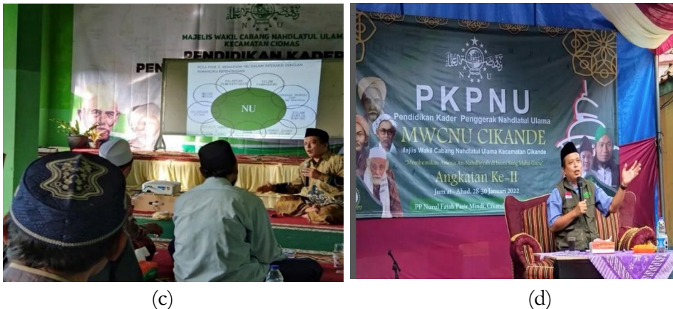
Figure 2. PKPNU Study area of: a) Padaricang b) Baros c) Ciomas d) Cikande

From the material content presented by the PKPNU team in the Banten region, what distinguishes it from PKPNU in other areas is the presence of material for the preparation of the NU generation in facing the 4.0 – 5.0 revolution era and the civilization of science and technology in scientific development which was once famous in the era of the golden civilization of Islam. Some science and technology books that are rarely taught in Islamic boarding schools are taught here, ideally there is also experimental practice, in addition to developing al-maktifatul tarbiyah as well as amaliyah , so that cadres know and know about technological civilization into the future as a provision to meet the future. Referential reference refers to the reference [Gus Pram, 2021] which refers to learning science and technology.